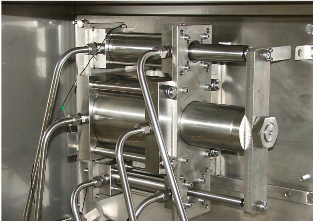
Close Up of the Piston Cylinder Assemblies