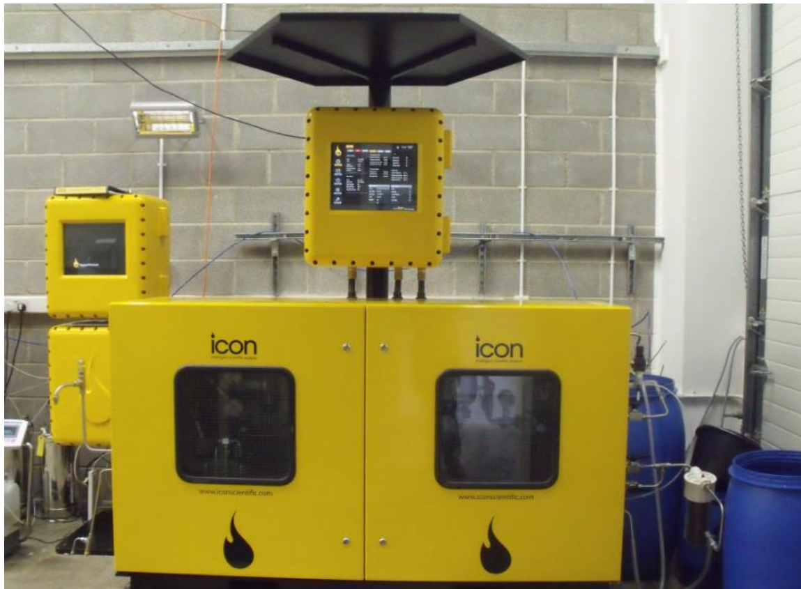
Complete Icon Scientific Ethanol Blender System Including Control Unit