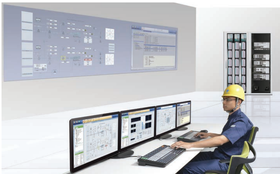
Fig.2. Yokogawa's CENTUM VP R6.01 integrated production control system

Solutions based on these concepts are now being introduced as part of Yokogawa's ongoing development process for its CENTUM VP integrated production control system (Fig.2). The first phase of this process addresses a number of "pain points" felt by many of today's plant owner-operators as they strive for greater operational integrity. These solutions are described below: