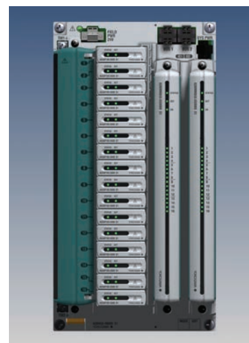
Fig.3. Yokogawa's N-IO (Network-IO) field I/O device for handling multiple types of I/O signals

N-IO (Network-IO) is a field I/O device with a versatile I/O module that can handle multiple types of I/O signals (Fig.3). Control systems rely on field I/O devices for the transfer of data to and from sensors, valves, and other types of field instruments. Using this data, they automatically control a plant's operations. Depending on instrument models, the type of electric signal used to transfer this data varies. With Yokogawa's current field I/O device, a compatible I/O module is needed for each signal type.