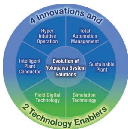
Fig.1. Key technologies and enablers for the next generation of control systems

Yokogawa has also identified two key technologies which it is using in developing these new innovations: field digital technology and dynamic simulation technology. These innovations are summarised in Fig. 1.