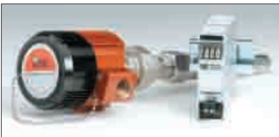
Figure 1: If an instrument meets design safety requirements, it can probably pass ATEX. The THZ2 and TDZ2 family of HART Temperature and Signal Transmitters from Moore Industries have acquired ATEX, cFMus (US/Canada), IECEx, CSA, and ANZEx (Australia) approvals for intrinsically-safe, non-incendive, and explosion-proof applications for Zones 0, 1 & 2.

In some cases, the instrumentation was perfectly adequate for the task and met nearly every other safety directive; but, because it had not yet been ATEX-certified, it was unacceptable. In general, an instrument that can meet most international safety directives (Figure 1) can probably meet ATEX requirements, but it first must pass the ATEX certification process. The devil is in the details, though. Sometimes changes have to be made to meet ATEX requirements.