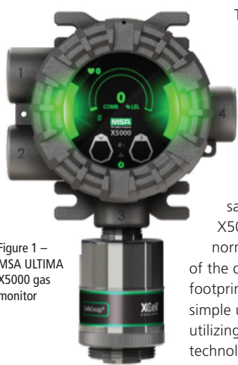
Figure 1 – MSA ULTIMA X5000 gas monitor

With the introduction of the MSA ULTIMA® X5000 and General Monitors S5000 gas monitors. For over 40-years, MSA has been the global leader in Fixed Gas and Flame Detection. With the addition of General Monitors in 2010, and our commitment to quality, we have developed the most advanced technologies to provide complete solutions for your gas detection needs.