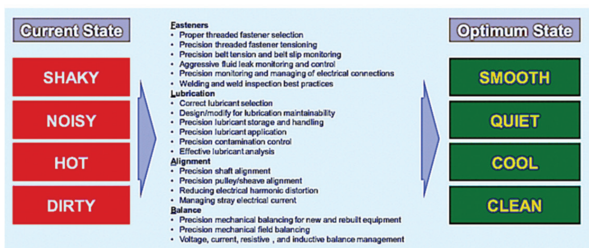
Figure 1. Wear protection and friction management of mechanical systems through FLAB (fasteners, lubrication, alignment and balance) [2]

Generally, shaky, noisy, hot, and dirty machines are known to be very inefficient, unreliable and release a large amount of waste while smooth, quiet, cool, and clean machines are optimal with regards to energy waste [2]. A machine can be optimized by