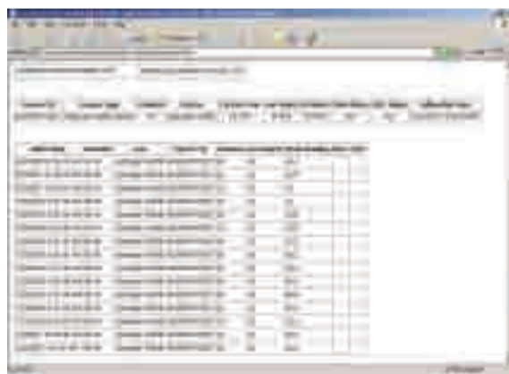
Figure 2. An Alarm event data file example recorded on a typical gas monitoring instrument.

Today's portable gas monitors generally have datalogging functionality as standard equipment. Dataloggers are capable of utilizing flexible recording intervals and having periods of data storage up to one year or more. Beyond storing gas levels, instruments also store a number of other parameters such as calibration dates, temperature readings, on/off times, minutes of operation and user identification and location information. Figure 1 is provided as an example of a typical datalog file from a portable gas monitor. Although many of the instruments available today have these features activated all of the time and record this information continuously, the data is rarely used for anything beyond after-the-fact investigations following a safety related incident. What is largely missed is that all of these parameters are useful for not only establishing what has occurred in the past (lagging indicators), but provide indicators for what potentially may occur in the future (leading indicators).