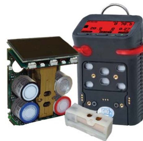
Figure 2: The G460 atmospheric monitor can support a wide variety of sensors including pellistor type LEL, PID and infrared combustible gases

If a lighter than air combustible gas is present (such as hydrogen or methane), the active bead will dissipate heat in the attenuated atmosphere more efficiently than the reference bead. If a heavier than air gas is present (such as propane) the bead is insulated by the denser atmosphere. The difference in temperature between the two beads is proportional to the amount of combustible present in the atmosphere being monitored.