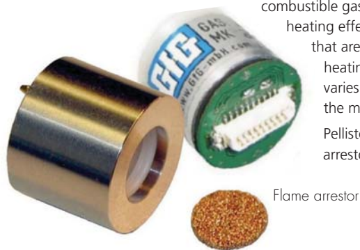
Figure 1: Combustible pellistor type sensor showing housing and detached flame arrestor

Small combustible gas molecules like hydrogen (H 2 ), methane and propane (C 3 H 8 ) diffuse through the flame arrestor very rapidly.