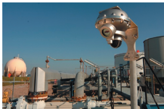
An ultrasonic gas leak detector installed in a gas plant in Denmark

Ultrasonic gas leak detectors, such as the Gassonic Observer, work by picking up the high-frequency ultrasonic leak noise, which is generated by all pressurized gas leaks. The performance standard is set according to which mass flow rate (leak rate) that needs to be detected. The main advantage of an