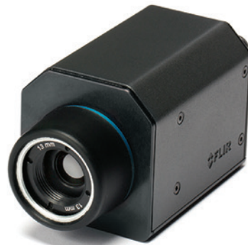
The FLIR A65 produces high-quality thermal images in 640 x 512 resolution, with temperature differences as small as 50 mK.

By design, external and internal leak detection methods widely used by the industry today are primarily intended for mainline transmission monitoring rather than pump station or pig trap environments. Acoustic cable-based sensors could be negatively impacted by valves and pumps, and use of fiber cable may be restricted as it cannot be run through valves and pumps off of the mainline and the leak may not generate enough acoustic noise for the system to alert. Moreover, these technologies do not have the ability to send a visual picture of a leak for verification, and so, would require a first response team to be dispatched to confirm an event.