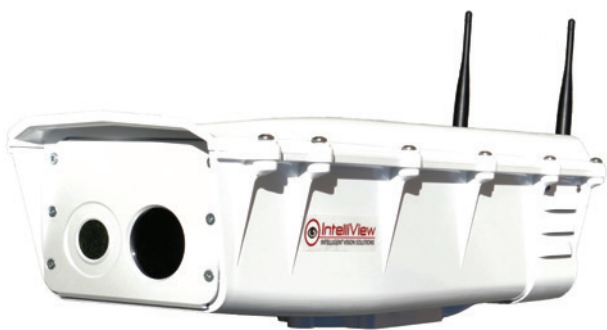
IntelliView's DCAM™ (Dual Camera Analytic Module) combines a visual and FLIR thermal camera with built-in proprietary leak analytics. Within its field of view, the DCAM can see a leak as small as 6 liters per minute within seconds of occurrence.

Monitoring the integrity of hundreds of kilometers of oil or gas pipeline networks may seem like a daunting task at first, but fortunately, technology can take over many of the labor-intensive tasks. Canadian video analytics specialist IntelliView knows the demands of oil and gas pipeline operators all too well. The company recently developed a smart camera solution, including a thermal camera from FLIR, to remotely monitor oil pump stations for leaks in an automated way.