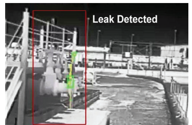
The FLIR thermal camera allows the DCAM system to provide very accurate detection results with an extremely low false alarm rate.

"The A65 is a compact thermal camera, which makes it easy to integrate into the DCAM system," says Beadle. "It is a very complete camera with a wide range of lenses and the ability to