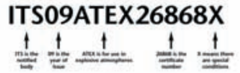
Figure 5. Certificate Number Example