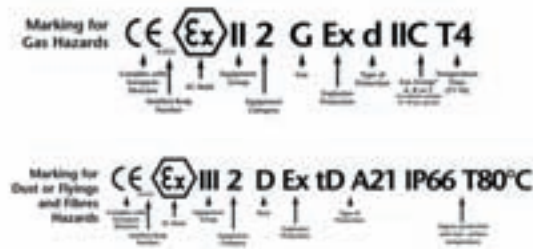
Figure 4. Certificate Coding Example

The marking details will also include the certificate number issued by the certification body.