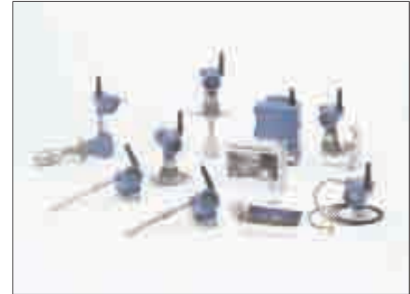
Wireless enabled instrumentation is available now

The products and knowledge are in place and the value clear for starting wireless now. By picking an application - even a small one - engineers can join early innovators that are enjoying the satisfaction of application improvements they could only imagine