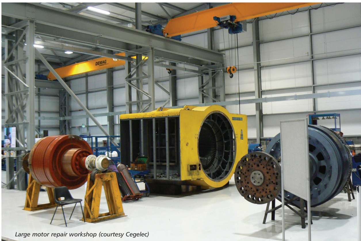
Large motor repair workshop

The new numbering system affecting the area classification standards is part of the move to cover both gas and dust in the IEC 60079 series. The next edition of the general requirements document IEC 60079-0 (due for publication later this year) will include both dust and gas/vapour requirements and will also introduce Equipment Protection Levels (EPLs). The EPL is defined in almost the same way as the related ATEX Category, but will use the lower case letters “a”, “b” and “c” rather than Category 1, 2 and 3. This should be no surprise to users of intrinsic safety equipment who have been familiar with levels of protection “ia” and “ib” over many years and are just now starting to get to grips with level “ic” which is replacing the “energy limited” requirements for Ex n equipment in IEC 60079-15. Encapsulation with