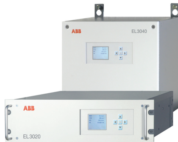
ABB EasyLine Gas Analysers

Many nations in may also wish to participate in CCS schemes, but if their country does not have the appropriate geological profile, they must rely on exporting their CO 2 . So, for the trade in CO 2 for CCS will inevitably become international. This is a key driver for the development of an international standard for CCS CO 2 purity to ensure a harmonised approach and consistent levels of safety. The standard will also lock in parameters that players in the CCS industry can design around to ensure optimal performance of their equipment.