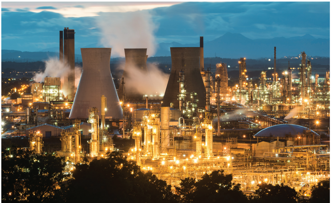
Grangemouth Oil Refinery Scotland

Process performance and gas distribution asset integrity are not the only reasons for careful analysis and control of CCS CO 2 purity. The safety of the personnel operating the CCS equipment and the general public are also of paramount importance. CO 2 intended for CCS may also contain trace levels of highly toxic chemicals such as mercury or hydrogen cyanide. Whilst operators cannot always prevent these molecules being present at tiny levels, they can monitor their concentrations to ensure that they exist in the gas