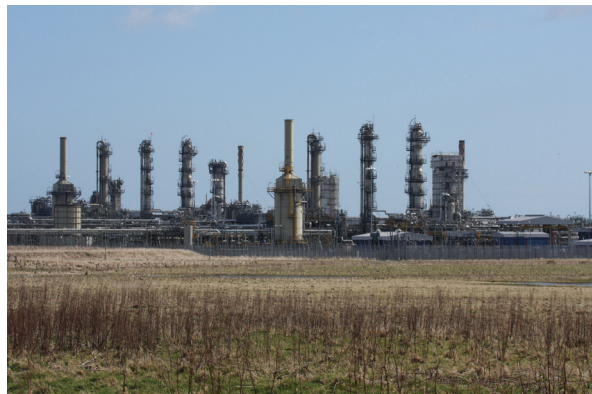
St Fergus gas receiving terminal

The examples above focus on hydrogen and methane but there are transferrable lessons to CCS because these gas standards need to specify maximum concentrations of similar impurities which could be harmful to the application. There may also similarities in the most suitable analytical methods to conduct analysis of trace impurities. So, in the consideration of a future standardised purity specification for CO 2 in CCS applications, there may be some parallels to learn from.