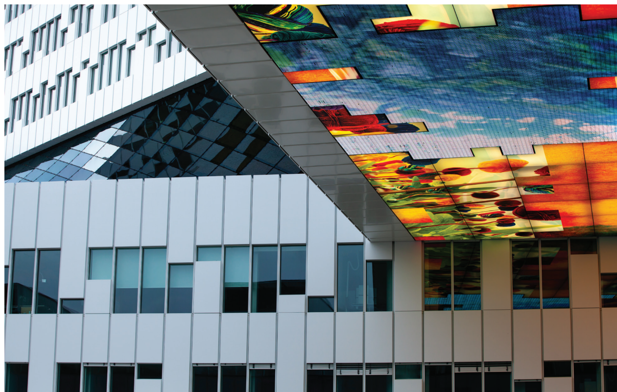
Equinor Head office Oslo

Before we store CO 2 deep underground, we must ensure that important gas purity criteria have been met. However, at present