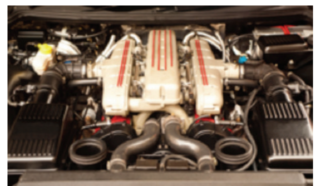
Most car engines use the same basic principle: The combustion of air and fuel creates rotational force which is used to move a car. See more car engine pictures.

This all boils down to the fact that the tighter your car's engine squeezes its fuel, the higher the fuel grade necessary to stave off annoying pinging or knocking caused by early detonation. So, if you happen to drive a car that is designed for high performance or maximum efficiency, don't try to skimp, and fill up your tank with regular; it will require at least mid-grade, if not premium. In fact,