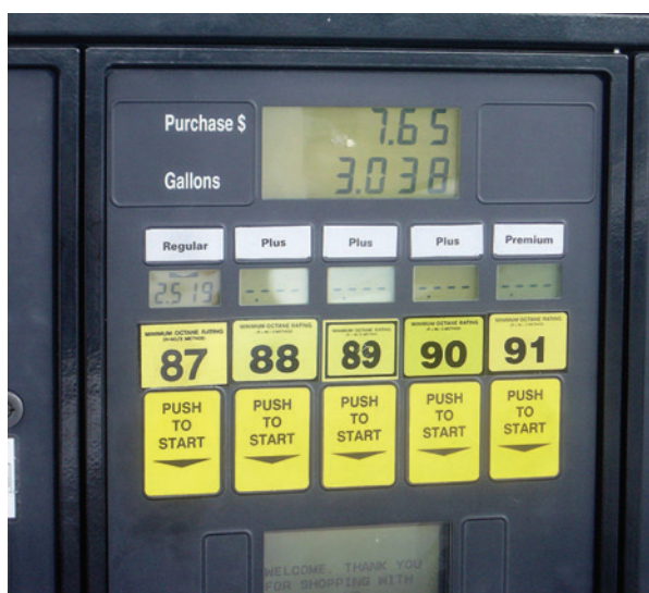
A gas station featuring five octane ratings.

Many people may not realize what determines which grade of fuel to use: The primary factor in determining this is the compression ratio (or CR). This refers to the delineation between volume of the combustion chamber, when the piston is at the bottom of the stroke, to the volume when it reaches the apex of top-dead-center. How high the compression ratio is depends on how great the difference is, and the more power an engine can generate for a specific size.