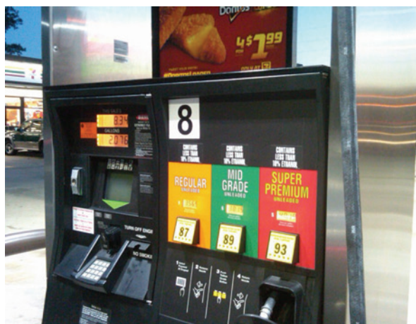
A modern fuel pump at a gas station on Jacksonville's Westside.

Octane numbers are assigned using the single cylinder Waukesha engine under specified conditions. Primary reference fuels are used, consisting of mixtures of 2,2,4-trimethylpentane, which was the best fuel tested and assigned an octane number of 100, and normal heptane, which was the worst fuel tested and assigned an octane number of zero. The octane number is the percent of 2,2,4-trimethylpentane in a mixture with normal heptane.