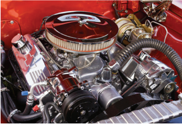
Classic Car Engine

getting other than what is recommended by your owner's manual is a very bad idea and that foolish frugality can even potentially nullify your vehicle's warranty. On the flipside, if you have a car where regular is specified, don't think you're doing your car any special favors by treating it to higher octane gas. Instead, do your wallet a favour, and remember that if the cheapest gas is indicated for your car, there may not be much benefit to giving it higher than 87 octane.