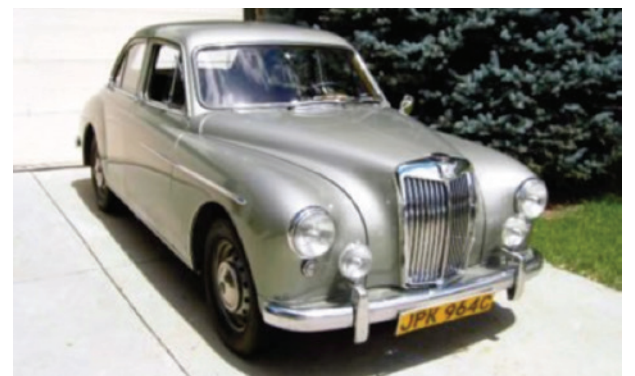
1958 MG Magnette

https://www.nconsumer.org/news-articles-eg/high-octane-fuel-doesnt-always-equal-better-performance-or-better-gas-mileage.html