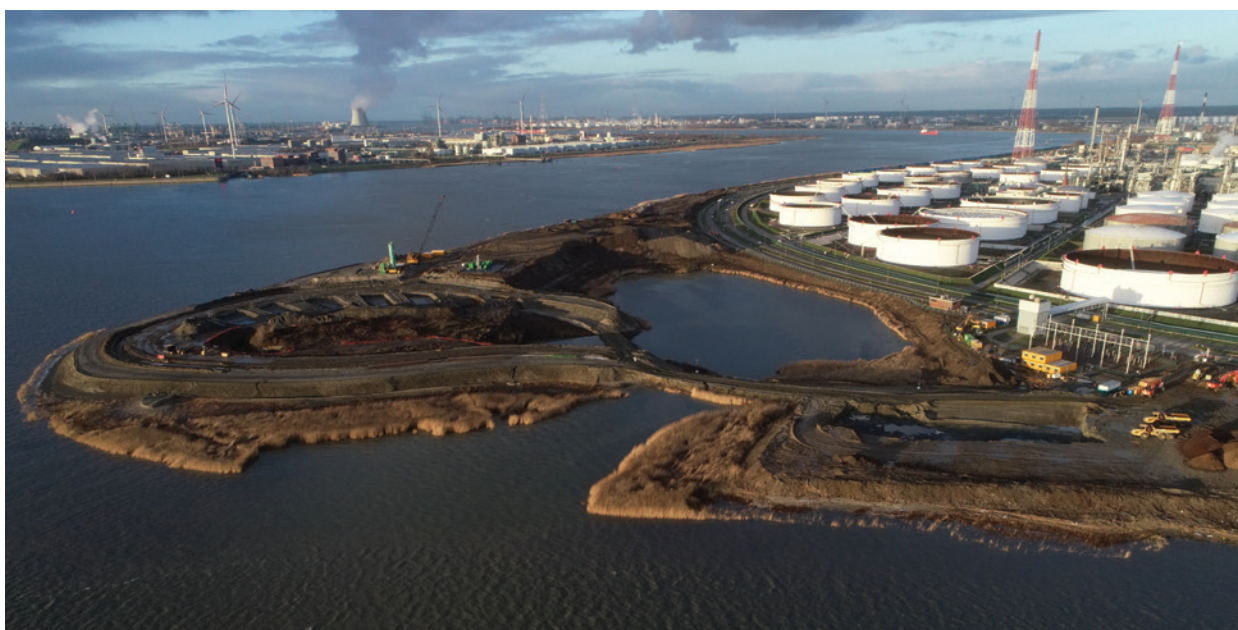
Fort Filips decontamination 2020

Read, Print, Share or Comment on this Article at: petro-online.com/Article