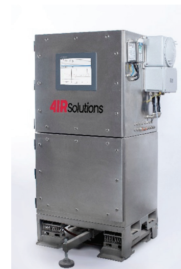
4IR Solutions' AI-60 is the only online real-time process analyser for opaque/dark material including crude oil.