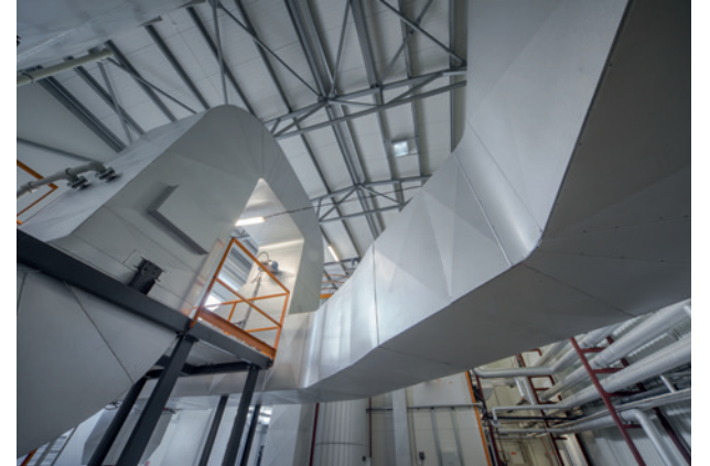
Figure 2: Forced Air