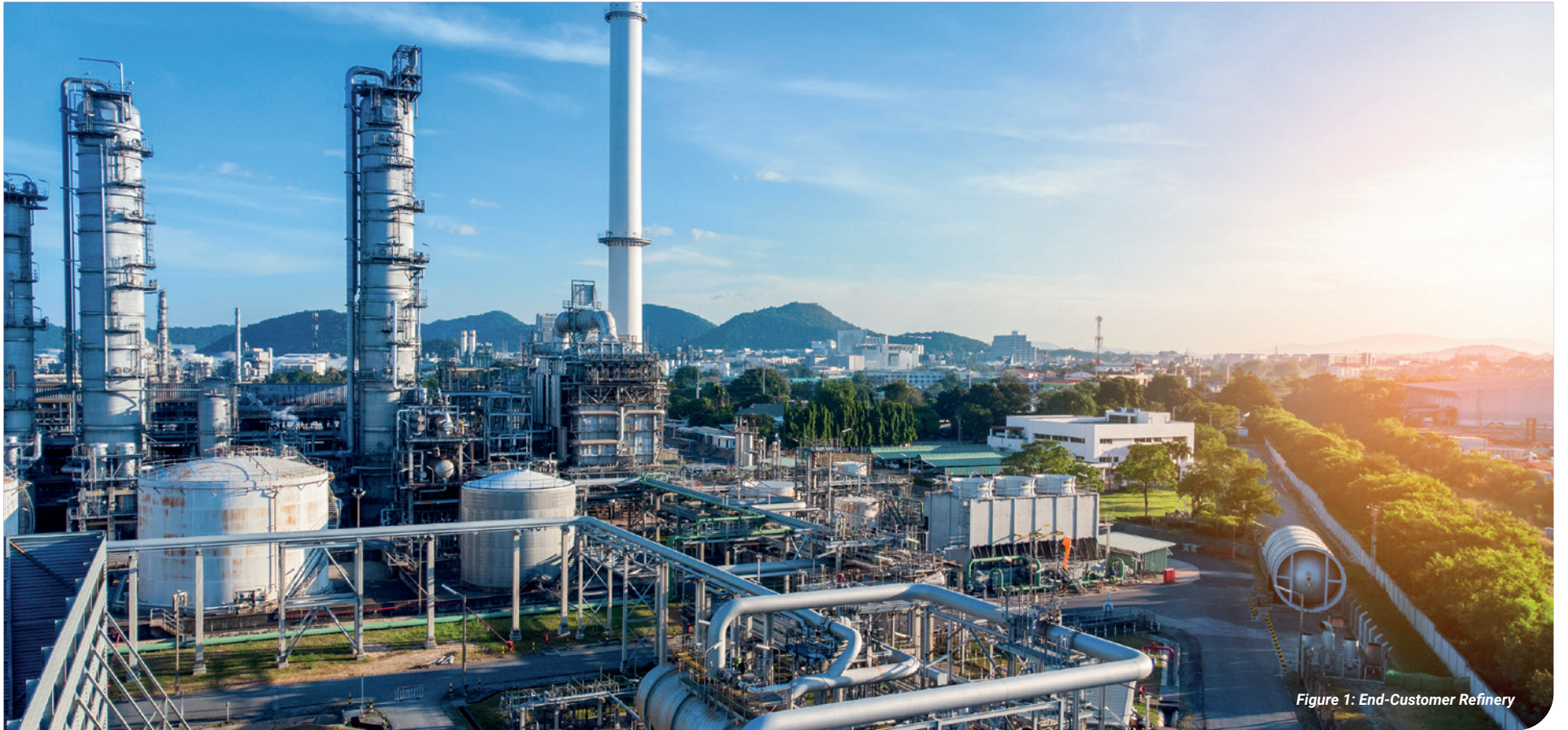
Figure 1: End-Customer Refinery

When the process and plant engineers at a major oil sands refinery in the province of Alberta, Canada, needed to replace their boiler system to upgrade its efficiency and thereby reduce its fuel costs and carbon footprint, they faced several technical challenges. Among them was the optimisation of the forced air flow to fuel gas ratio that would optimise the boiler flame burn rate for the most consistent, lowest cost heating under all operational and weather conditions.