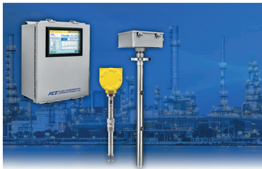
Figure 4: FCI MT100 Series Multipoint Flow Meter

The MT100's large colour touch-screen LCD readout provides