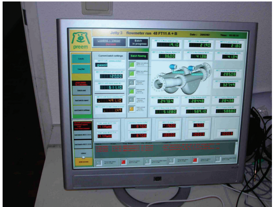
SCADA visualization of flow calculations

Endress+Hauser Instruments International AG Kaegenstrasse 2 4153 Reinach Switzerland www.oil-gas.endress.com +41 61 715 81 00 oil-gas@ii.endress.com