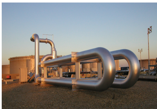
SPSE (Société du Pipeline Sud Européen) prover used for the oil calibration of Promass Coriolis mass flow meters

making replacement very easy and limiting additional costs for installation.