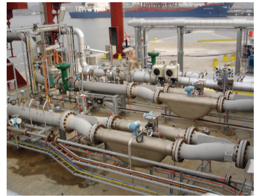
Installation of tandem Promass meters on new Preemraff jetty

Promass provides a direct and highly accurate mass measurement for loading and off loading. This is due to the fact that all Endress+Hauser mass flow meters are calibrated on an accredited test rig with hydrocarbons that have the same characteristics as the hydrocarbons that are measured by the flow meters in customers' applications. Promass is also calibrated and approved by NMI for bidirectional use, meaning that Promass can be used for loading and off loading in the same set up.