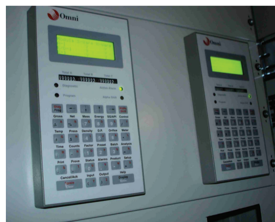
OMNI flow computer

As soon as the tanker enters the jetty, loading or off loading can begin. When finished, the mass measurement is immediately available and the customer can, in turn, immediately produce the "Bill of loading". As a result, the amount of time the tanker is in the harbor is greatly reduced. Also, the faster the tanker leaves, the more hours available for other tankers at the harbor.