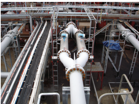
Promass installation at Preemraff Lysekil on an existing jetty replacing an old turbine meter and filter.

Since Sweden has no oil deposits of its own, crude oil is imported by tanker from various overseas sources included North Sea suppliers, Russia, the United Arab Emirates and other countries. About 65 percent of the refined products are exported, again by marine transport, to Northern Europe and the USA, with the rest remaining in Sweden.