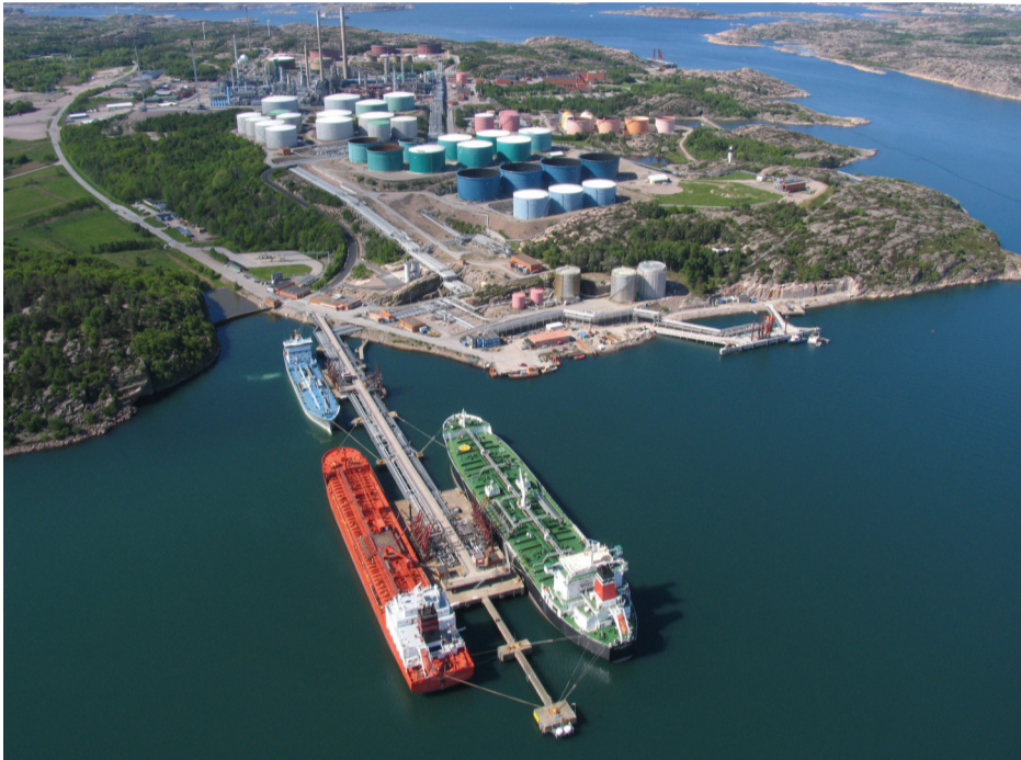
Preemraff Lysekil oil refinery in Sweden.