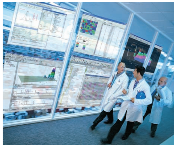
Fig 2 – SampleManager is used in process environments such as PEMEX

Oftentimes there are no organization-wide standards for testing and analysis, so routine analysis is dependent upon individual experience and skill. This presents significant constraints for personnel rotation. Moreover, analytical methods, job routines, reports and units often are not unified and consolidated.