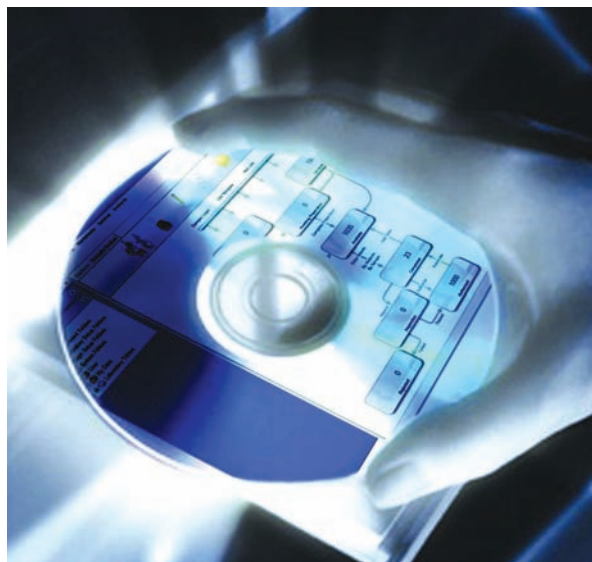
Image 5 – Thermo's SampleManager version 9 is scalable for a large user base

The standardization of SampleManager across all of PEMEX's gas processing facilities has resulted in a substantial reduction of the company's production costs. Indeed, standardization could achieve an estimated production cost savings of over $500,000 per year. Already there has been a notable increase in revenues generated by the improved productivity and quality of the products. The use of an enterprise-wide LIMS solution has helped PEMEX to improve product quality and accelerate time to market at a lower cost by converting raw data into real-time knowledge for fast, timely and