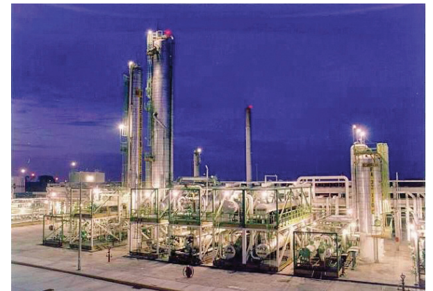
Fig 3 – PEMEX is the largest company in Mexico

In addition, it was necessary for the specific LIMS solution to operate under Good Laboratory and Manufacturing Practices, speeding up operations for increased product quality. PEMEX sought to establish a system that would maintain the parameters and specifications that certify its products under a strict quality control process and ensure regulatory compliance. Specification checking was also required to achieve greater profitability, as well as to contribute to better inventory and shipping management. The LIMS of choice