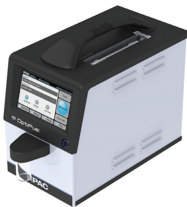
Fig 1: OptiFuel

For almost 20 years, PAC has been at the forefront of fuel analysis with its robust PetroSpec products. By using powerful and more versatile FT-IR technology, we are now combining the best of our GS PPA, TD PPA and QuickSpec capabilities into one analyzer, and adding many more features. OptiFuel is not a mere replacement of our legacy products, it is the best FT-IR dedicated fuel analyzer in the market.