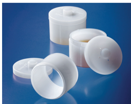
Fig. 1: Prepared lubricating oil sample

The S8 TIGER is an ideal solution for analysing petroleum products. It uses a 4kW end-window X-ray tube with an ultra-thin 75µm beryllium window. A closely coupled optical path helps provide high intensities and low detection limits for all elements.