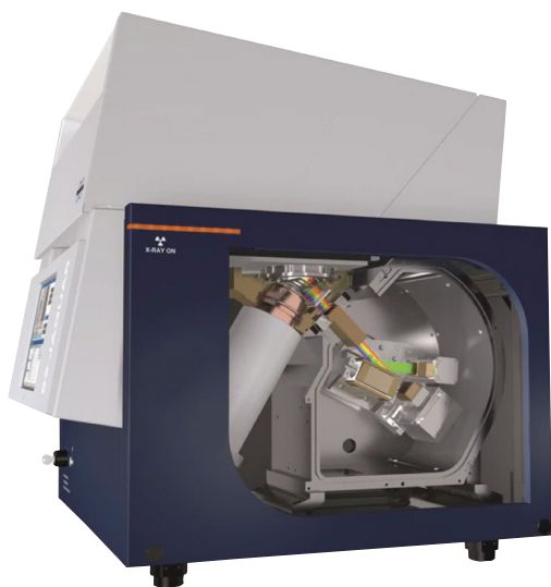
Fig. 1 HighSense™ Technology.

The WDXRF spectrometer S6 JAGUAR is equipped with Bruker's 400 W HighSense™ X-ray tube (Fig. 1). This makes the S6 JAGUAR the most powerful benchtop WDXRF unit on the market! Modern software with built-in audit-tracking and state-of-the-art hardware enables best-in-class analytical performance. The S6 JAGUAR achieves outstanding sensitivity for a wide range of elements (F to U) and the various configuration options allow us to optimise the system for your needs.