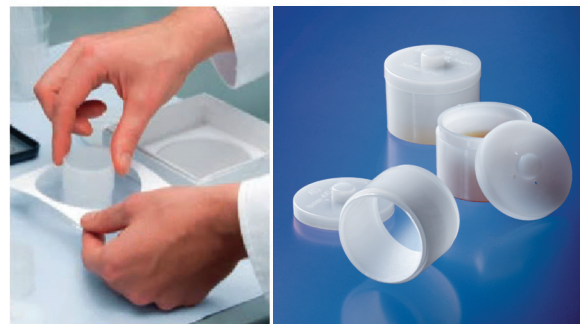
Fig. 2 Preparation of liquid samples.

Two sets of standards – six samples for ASTM D5059 A and seven samples for D5059 C – were prepared. The internal standard Bi was in a separate bottle and was mixed with the other samples according to the ratio defined in ASTM methods D5059 A and C, see. The standards and their concentrations are listed in Tab. 1.