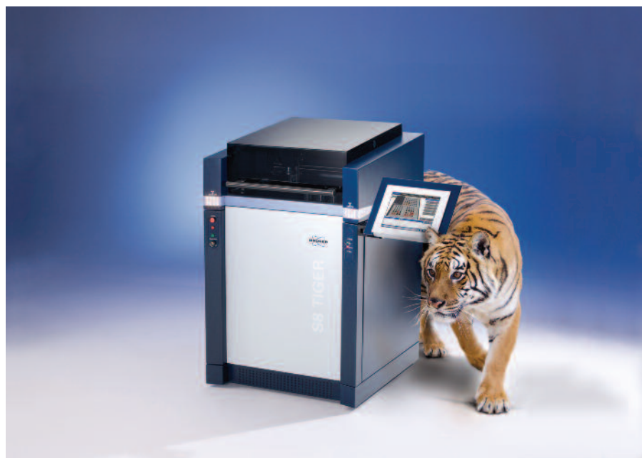
Figure 1: WDXRF spectrometer S8 TIGER

The norm which describes the low sulphur fuels analysis by WDXRF is now ISO 20884 and ASTM D 2622 for the very low range down to 5 ppm. As matrix effects hardly vary when analysing fuels, only ISO 20884 and ASTM D 2622 could be established without an external standardisation. The concentration range is subdivided in a low range (5 - 60 mg/kg) and a high range (> 60 - 500 mg/kg). This report describes how the modern WDXRF spectrometer S8 TIGER analyses effectively the low sulphur type fuels on a daily basis. The high spectral resolution and the enhanced light element determination the wavelength dispersive X-ray fluorescence (WDXRF) spectrometer S8 TIGER easily achieves detection limits down to 0.2 ppm.