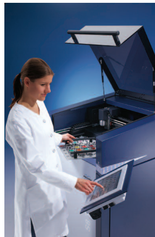
Figure 2: SampleCare system to enable safe analysis of liquid samples

All data obtained using the following measurement parameters are listed in table 1. The helium mode with atmospheric pressure is applied, because of the high volatility of fuel samples.