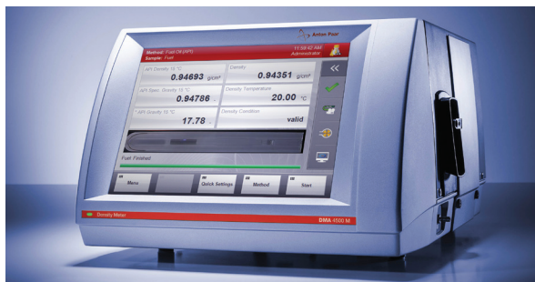
Figure 3. The DMA 4500 M density meter

The protection of employees as much as legal requirements for environment and navigation characterize the careful handling of fuels. The legal requirements for fuels used for inland waterway vessels in Austria are very strict, but are meticulously adhered to by Ferrexpo. The fact that swans have made their home in the vicinity of the bunker station is testimony to this.