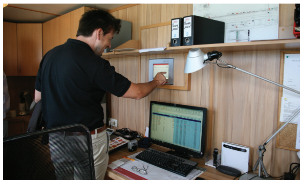
Figure 2. The mPDS evaluation unit can be operated from the office