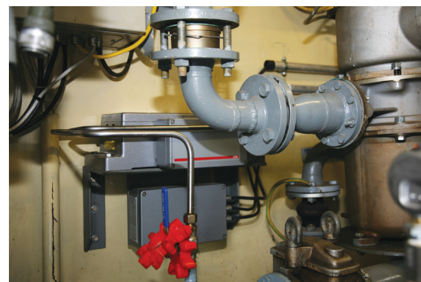
Figure 1. DPRn measuring cell with density sensor

The DMA 4500 M density meter (see Figure 3) delivers fast and