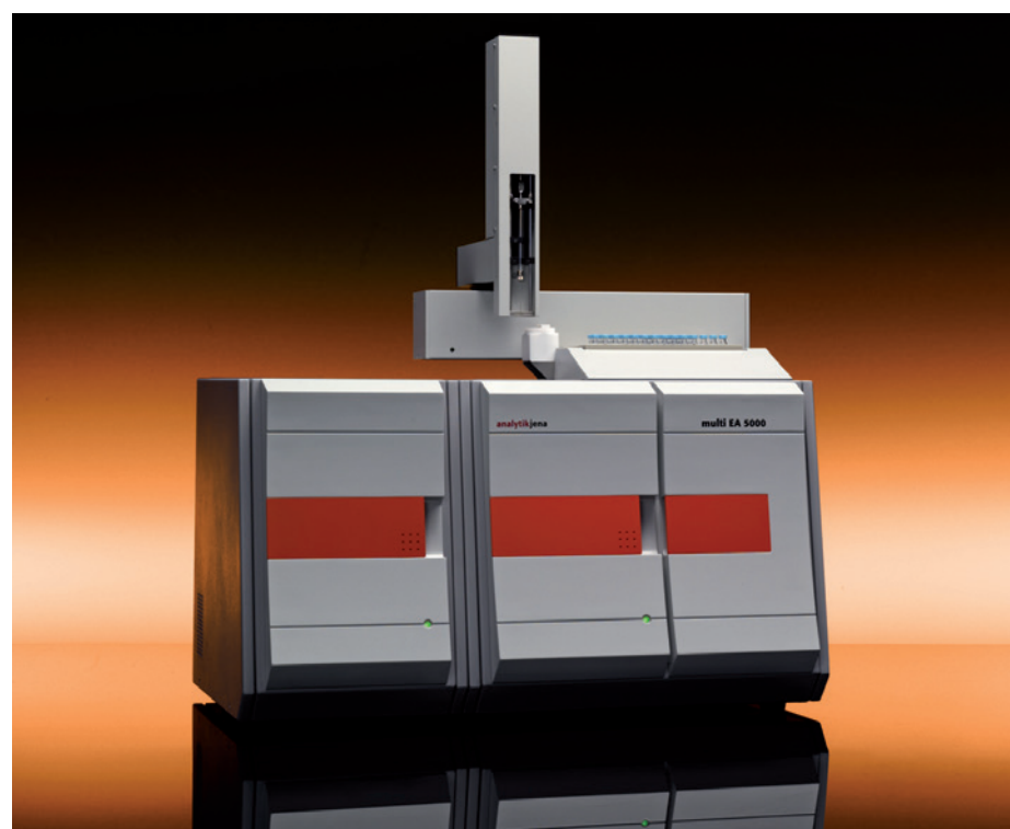
Fig. 1: multi EA® 5000

Comfort and safety of the system's performance is ensured via a number of integrated sensors which are permanently monitoring all important parameters of the system such as gas flows, tightness, internal pressure, temperature and so on.