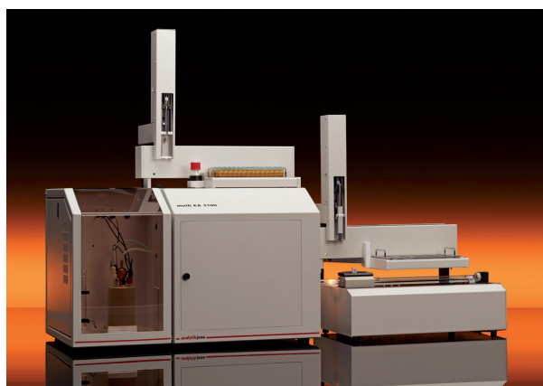
Fig. 1 multi EA® 3100 elemental analyzer