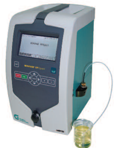
MINIVAP VPXpert – Expert vapour pressure testing at highest temperatures.

Known worldwide as "The vapour pressure specialist", GRABNER INSTRUMENTS has developed the MINIVAP VPXpert, a new extremely versatile analyser to assess temperature at different V/L ratios for ASTM D5188 tests. The MINIVAP VPXpert also is the optimum solution for testing vapour pressure of gasoline-ethanol blends at high temperatures. It allows for ramp measurements up to 120°C, providing the highest temperature range of vapour pressure testers on the market. Incorporating the world famous GRABNER vapour pressure test method, the analyser complies with all industry vapour pressure testing standards, thus enabling safe development of the new generation automotive engines for ethanol blended fuels.